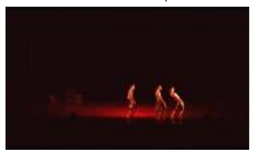
Figure 2. The position of the dancers making a straight line in the center of the front of the stage (Photo: Andhika, January 14, 2019)

holding the head of the other dancer. Next, the dancer moves into a triangular floor pattern in the middle, then runs backwards and past one by one randomly. This scene describes a conflict that occurs in an social friendship.