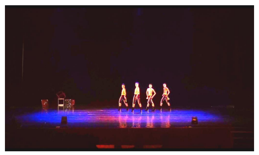
Figure 4. Posing the ending (Photo: Andhika, January 14, 2019)

The form of presentation of the Beauty of Men dance work is a picture of the creator who was once a member of a cabaret group. In it there are some beauty in motion such as twisting movements, foot slides, and walking like on a catwalk stage. All of these movements have aesthetic value.